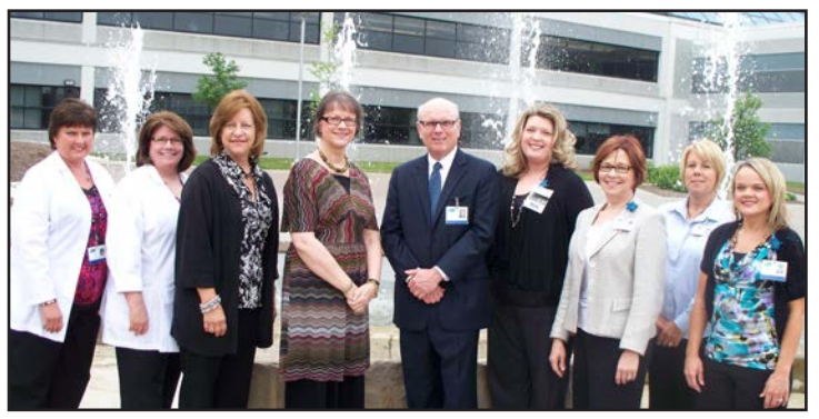
Care Transitions at Adena Medical Center

in March 2012. CCTP currently includes more than 126 acute care hospitals across 30 sites to provide care transitions services for an estimated 223,172 Medicare beneficiaries in 19 states. CCTP was created by the Affordable Care Act and will continue to grow and add sites.